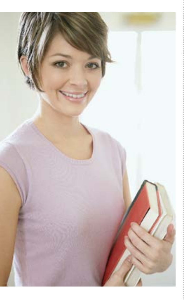
Determining how to suceed in Law, Public Safety, Corrections, and Security starts with planning.

Your future career can be fun, or it can make you totally miserable, depending on whether or not you choose one that fits your unique personality, interests, goals, and abilities. Planning to be a nurse, for example, makes no sense if you can't stand the sight of blood. Forget being an engineer if you aren't going to take on advanced math. And if you live to be outdoors, opt out of a profession that keeps you cooped up in an office all day. The truth is, earning a living for about 40 years is a lot more rewarding—financially and otherwise—if you find the profession that fits you perfectly.